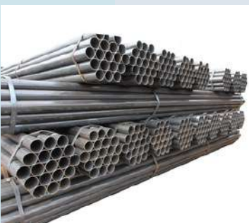
MS & GI Pipes