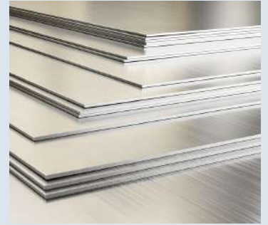
Sheet / Plates