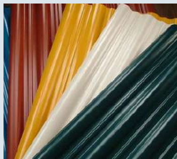
Colour Coated Sheets