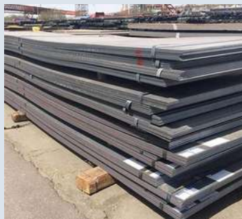
Special Quality Plates