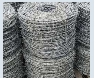
Barbed / Binding Wires